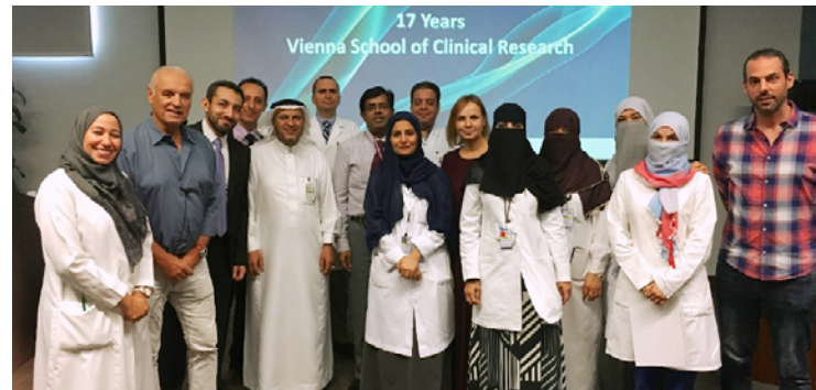
VSCR GCP course participants, King Abdul-Aziz Medical City, Jeddah, Saudi Arabia