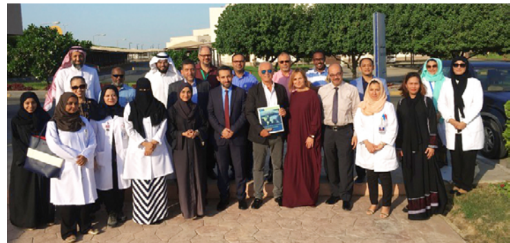
VSCR GCP course participants, King Fahad Specialist Hospital, Dammam, Saudi Arabia

“The workshops were done in those strategic cities to familiarize researchers with the structure and content of regula-