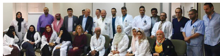
VSCR GCP course participants, King Fahad Medical City, Riyadh, Saudi Arabia